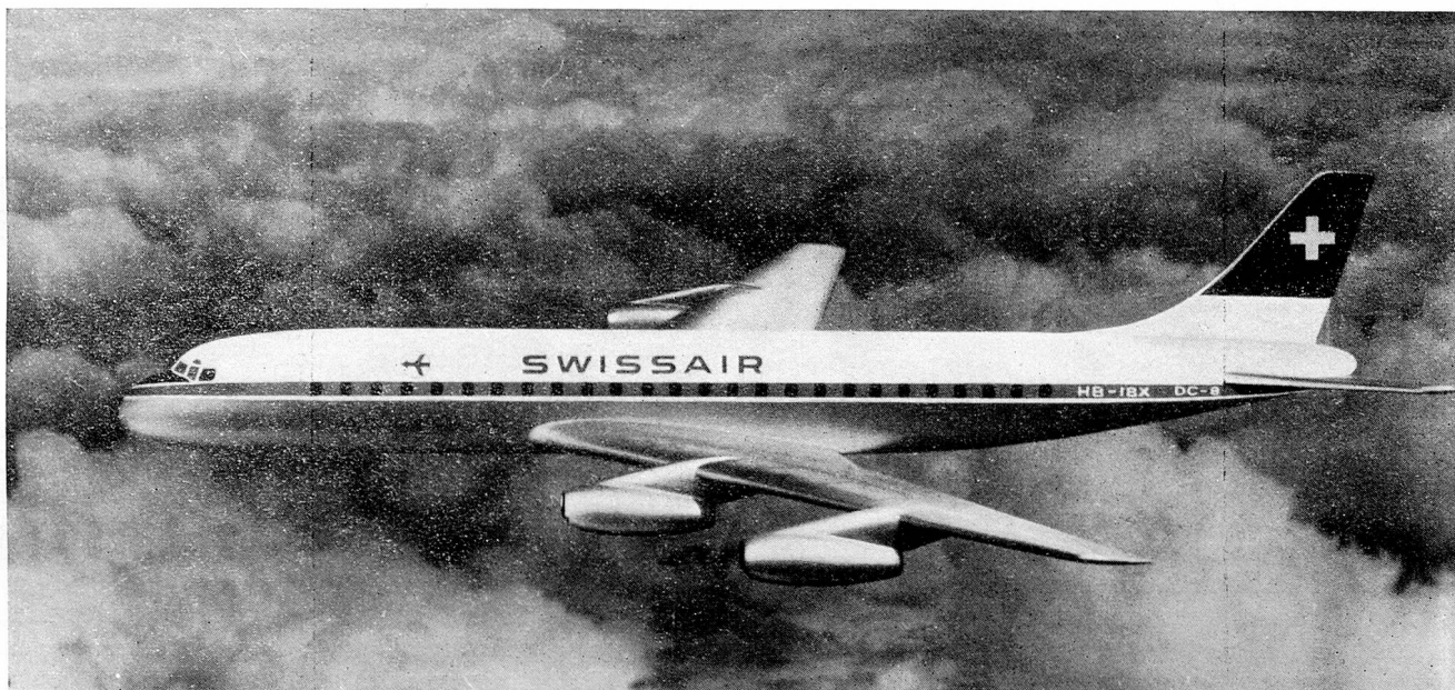
In 1960 Swissair will enter the jet age with the introduction of three of these giant Douglas DC-8 jet liners on the long-haul routes. They will seat up to 140 passengers and fly non-stop from Switzerland to New York in under eight hours.