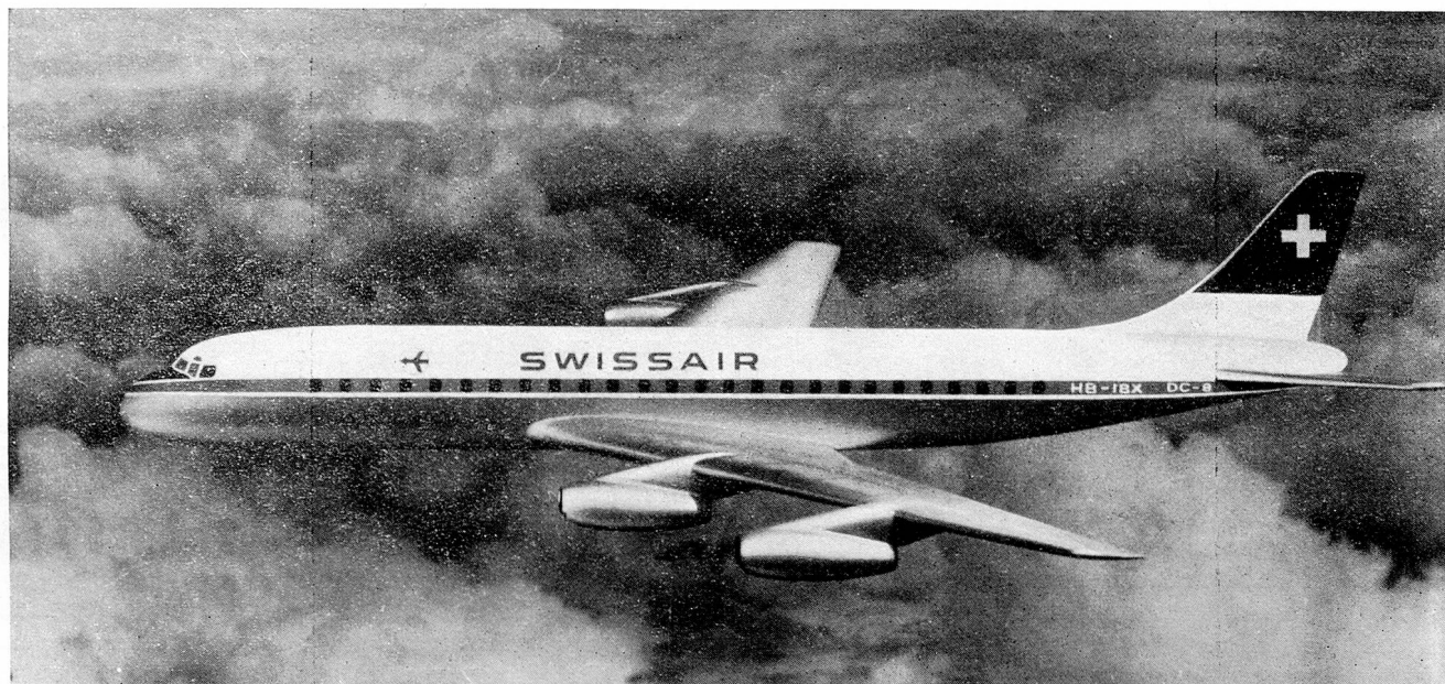
In 1960 Swissair will enter the jet age with the introduction of three of these giant Douglas DC-8 jet liners on the long-haul routes. They will seat up to 140 passengers and fly non-stop from Switzerland to New York in under eight hours.

Like a ship in harbour an aircraft on the ground earns nothing! When that aircraft has a revenue potential of some £22,000 per working day it becomes vitally important to ensure that it is employed one hundred per cent from the day it leaves the factory. Furthermore when the size, speed, cruising altitude and capacity are double that of previous equipment and the power plant unfamiliar, some very considerable preparation is required by the purchasing airline.