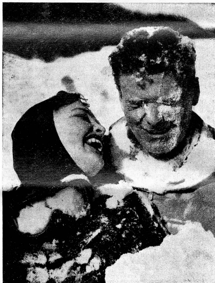
The sparkling fun of snow and sun