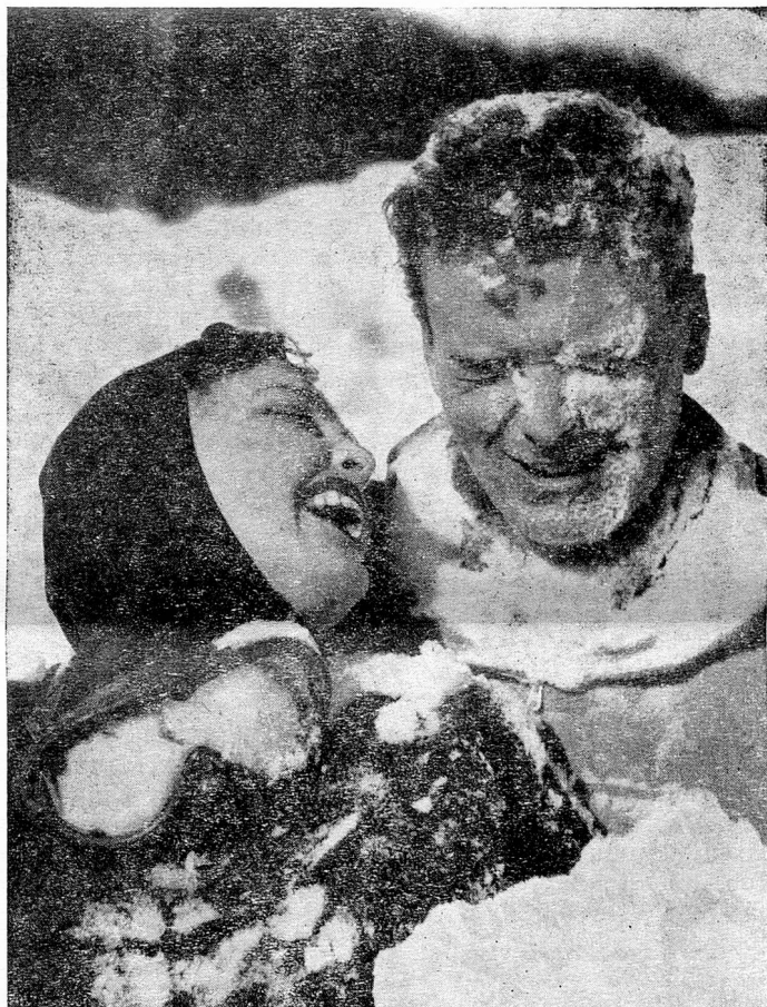
The sparkling fun of snow and sun