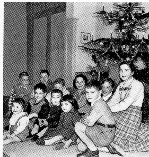
Happy children of Swiss families living abroad are celebrating their first Christmas in their homeland. Glückliche Auslandsschweizer-Kinder erleben im "Home" ihre erste Weihnachtsfeier in der Heimat.

«Home» for Swiss Nationals Living Abroad — a «pied-à-terre» in the homeland