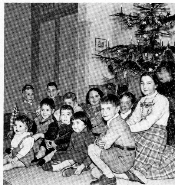
Happy children of Swiss families living abroad are celebrating their first Christmas in their homeland. Glückliche Auslandsschweizer-Kinder erleben im "Home" ihre erste Weihnachtsfeier in der Heimat.

«Home» for Swiss Nationals Living Abroad — a «pied-à-terre» in the homeland