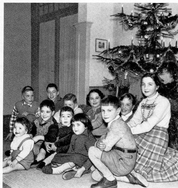
Happy children of Swiss families living abroad are celebrating their first Christmas in their homeland. Glückliche Auslandsschweizer-Kinder erleben im "Home" ihre erste Weihnachtsfeier in der Heimat.

«Home» for Swiss Nationals Living Abroad — a «pied-à-terre» in the homeland