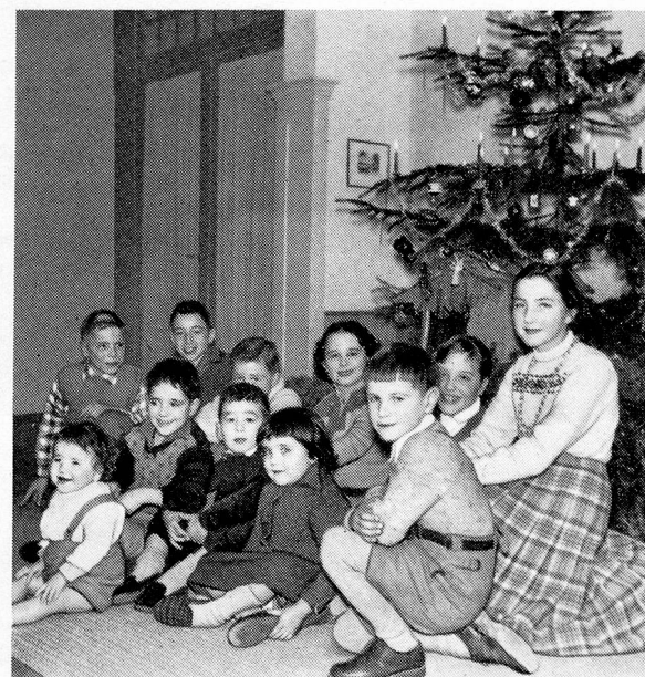
Happy children of Swiss families living abroad are celebrating their first Christmas in their homeland. Glückliche Auslandsschweizer-Kinder erleben im "Home" ihre erste Weihnachtsfeier in der Heimat.

«Home» for Swiss Nationals Living Abroad — a «pied-à-terre» in the homeland