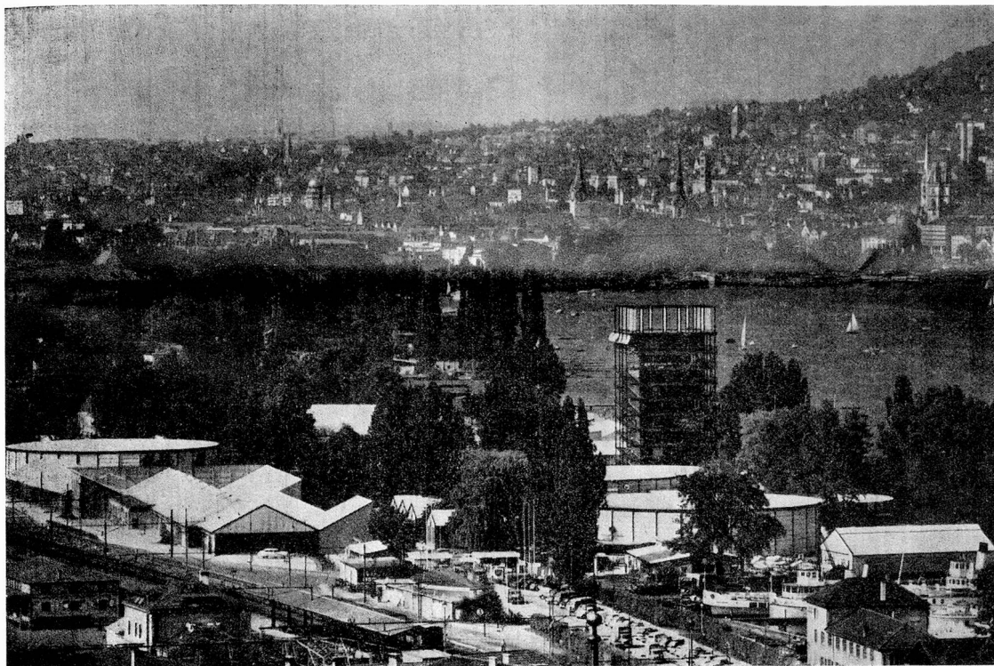
The "SAFFA", 1958. General View of the Lake and Town of Zurich.