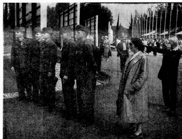
Some of the young recruits who have come from abroad to do their National Service (Picture above).

The Secretary of the "Home" will be pleased to accept your bookings, without any obligation, and will gladly supply any information desired about costs, schooling fees etc. Your wishes and suggestions are always welcome.