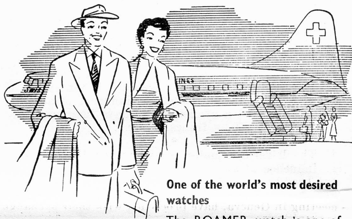
One of the world's most desired watches