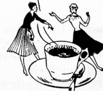
Nescafé is a registered trade mark to designate Nestlé's instant coffee.