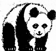
Regd. Trade Mark

Everyone adores them they're so so gay and colourful in a variety of designs:— stripes, spots, checks and tartans. Also self colours in satins, taffetas, failles and petershams. Ask for "Panda" and know you are buying the best.