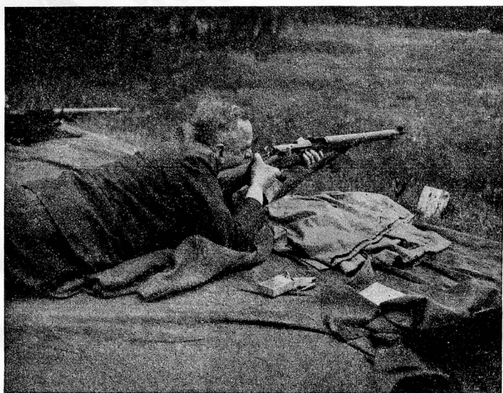
Swiss Ambassador in action.