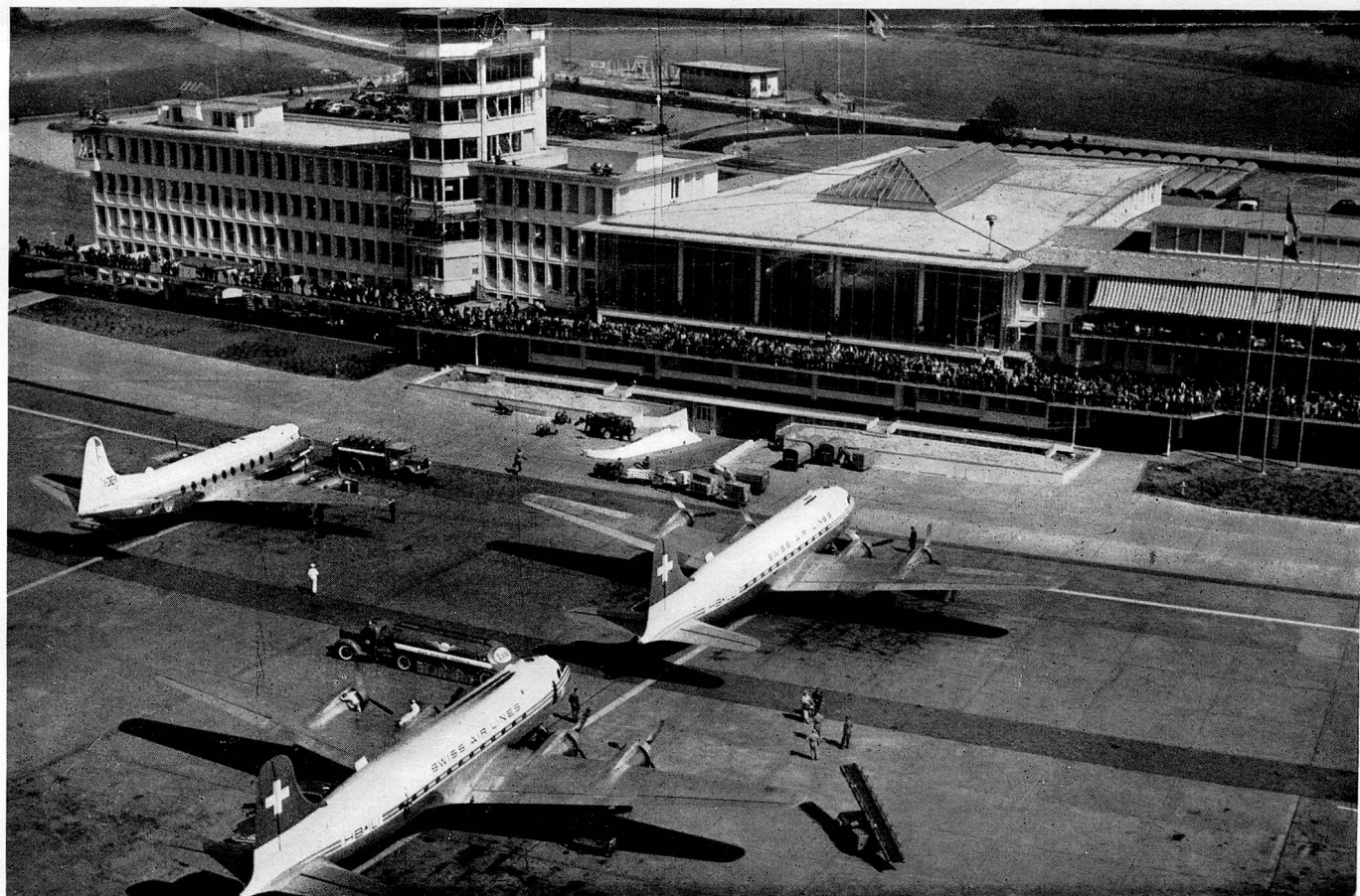
KLOTEN AIRPORT — ZURICH.

been quickening, they took decisions of courage and sound business sense which improved not only the internal efficiency of the organisation but safeguarded the very existence of Swiss commercial aviation. At a time when the future held many uncertainties, emphasis was placed on the development of long-haul traffic which produced better results in terms of revenue and aircraft utilisation. The equipment programme has always reflected the Management's desire to operate the most modern aircraft on all routes, but without neglecting the particular requirements of any part of the network.