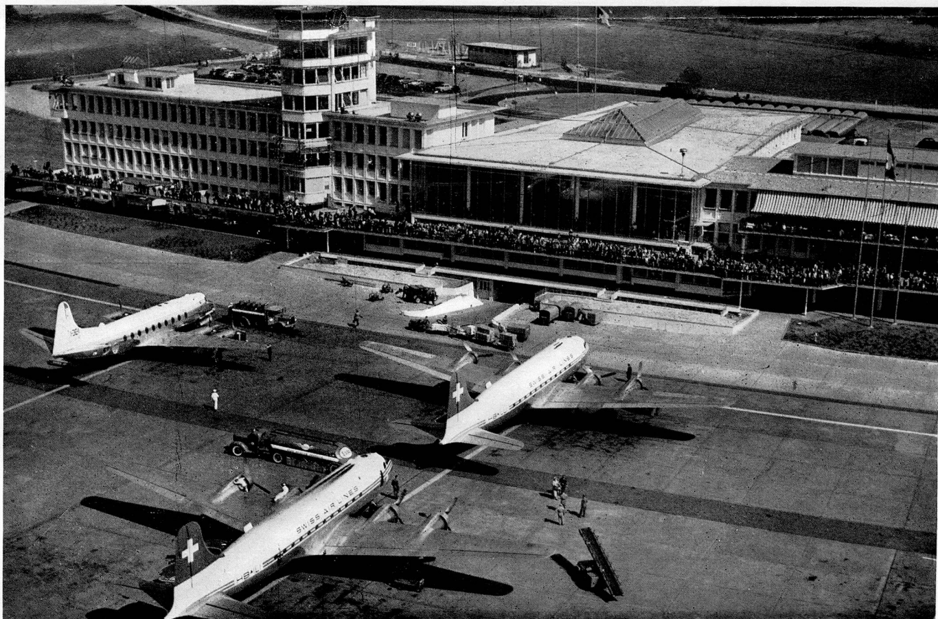
KLOTEN AIRPORT — ZURICH.

been quickening, they took decisions of courage and sound business sense which improved not only the internal efficiency of the organisation but safeguarded the very existence of Swiss commercial aviation. At a time when the future held many uncertainties, emphasis was placed on the development of long-haul traffic which produced better results in terms of revenue and aircraft utilisation. The equipment programme has always reflected the Management's desire to operate the most modern aircraft on all routes, but without neglecting the particular requirements of any part of the network.