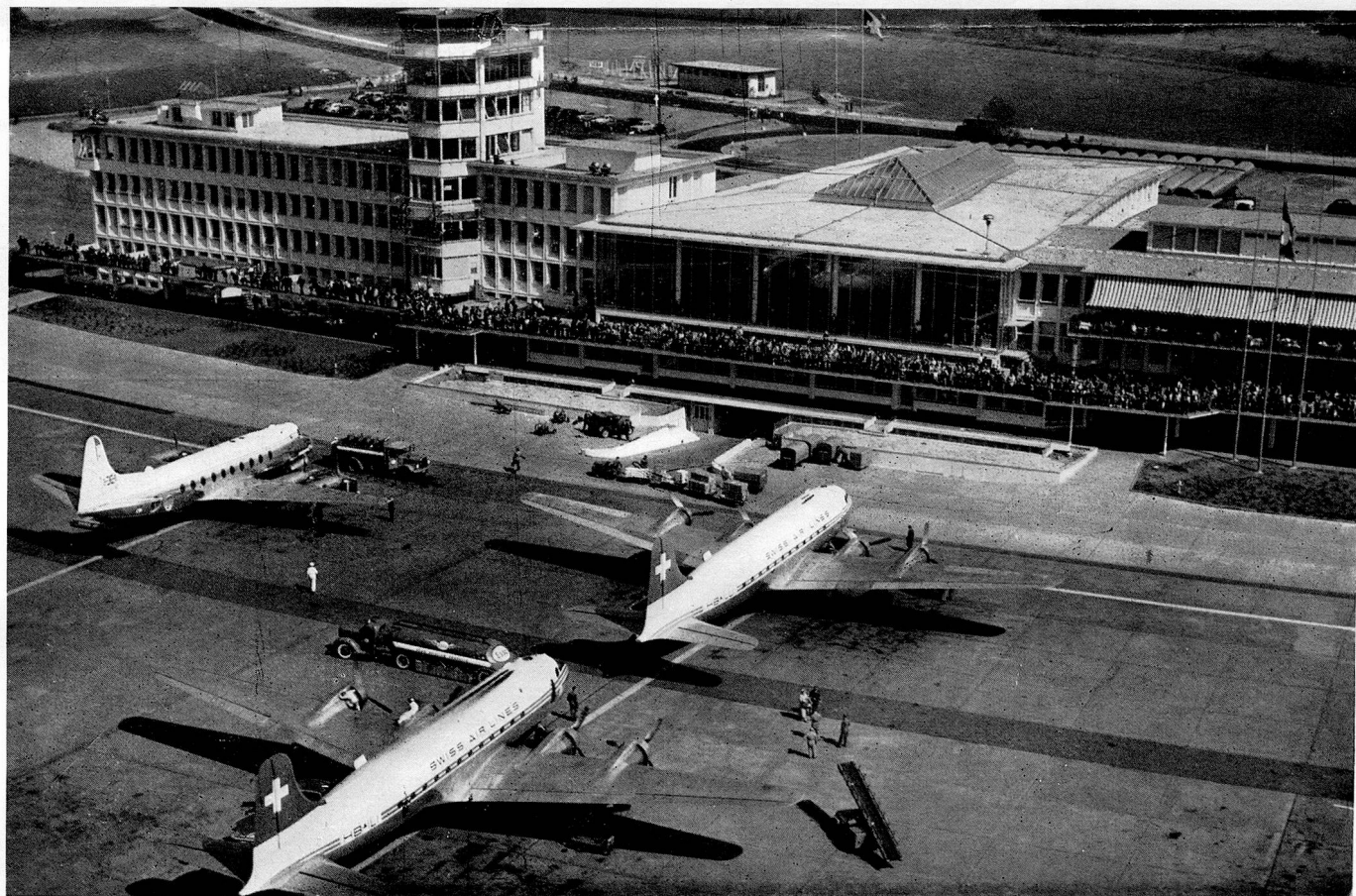
KLOTEN AIRPORT — ZURICH.

been quickening, they took decisions of courage and sound business sense which improved not only the internal efficiency of the organisation but safeguarded the very existence of Swiss commercial aviation. At a time when the future held many uncertainties, emphasis was placed on the development of long-haul traffic which produced better results in terms of revenue and aircraft utilisation. The equipment programme has always reflected the Management's desire to operate the most modern aircraft on all routes, but without neglecting the particular requirements of any part of the network.