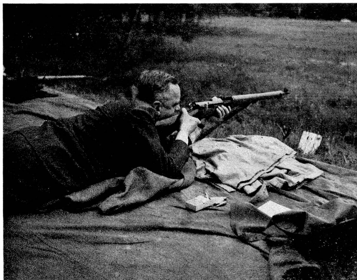
THE SWISS MINISTER IN ACTION.