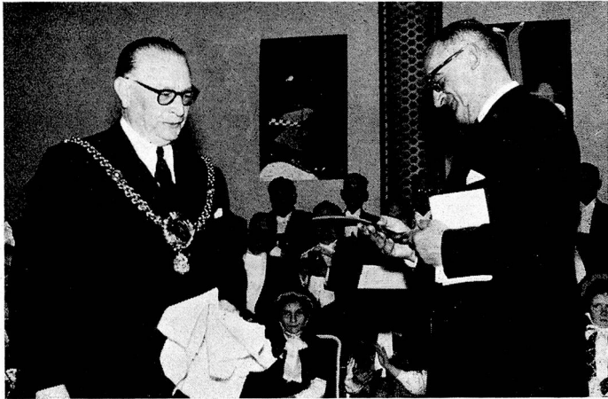
A carved loving spoon is presented to the Swiss Minister by the Lord Mayor of Cardiff.

The evening ended on a note of informal friendliness. Autographs and addresses were exchanged, Welsh hosts and Swiss guests had plenty to chat about. In the background, the gleaming skis stood guard — promising links between Swiss snow and Welsh sand.