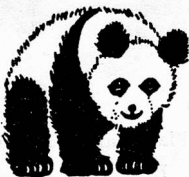
Regd. Trade Mark

Everyone adores them they're so so gay and colourful in a variety of designs :— stripes, spots, checks and tartans. Also self colours in satins, taffetas, failles and petershams. Ask for "Panda" and know you are buying the best.