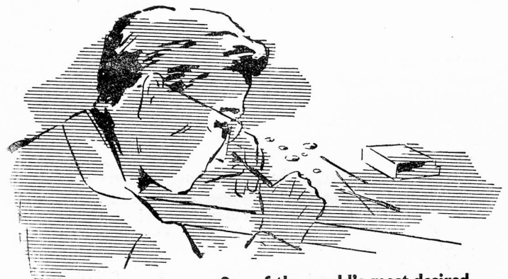
One of the world's most desired watches

The ROAMER watch is one of Switzerland's precision products. In a factory established in 1888 over 1200 highly skilled craftsmen produce and assemble every part that goes into the ROAMER movement.