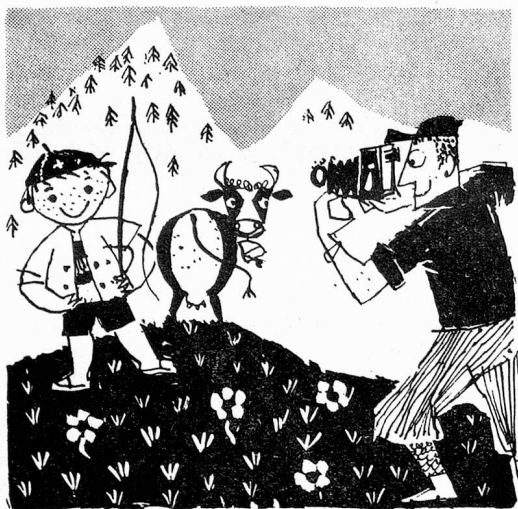
Swiss National Tourist Office, 458, Strand, London, W.C.2