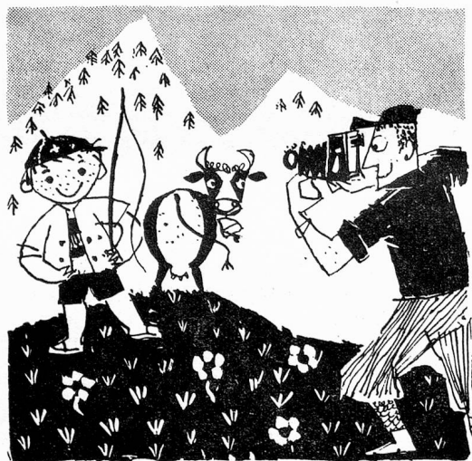
Swiss National Tourist Office, 458, Strand, London, W.C.2