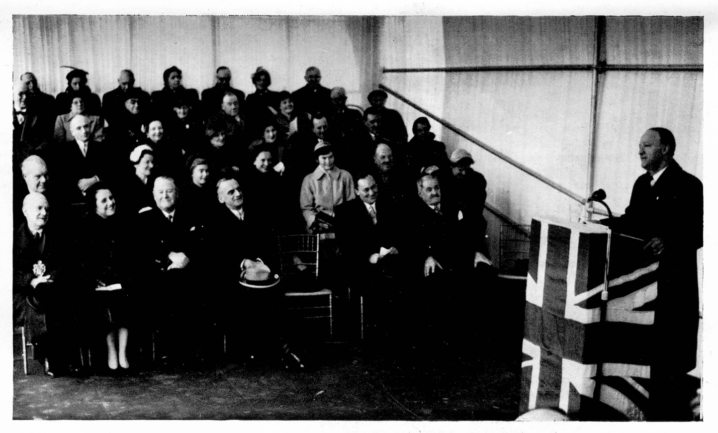
THE CHANCELLOR'S ADDRESS.

These Works are so called because they were first planned in the Coronation Year of Her Most