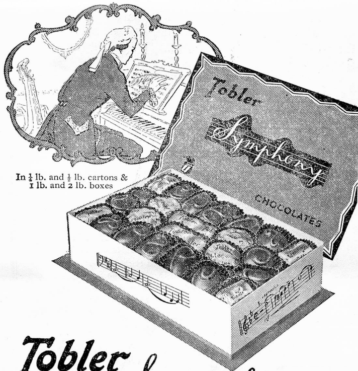
In ½ lb. and ¾ lb. cartons & 1 lb. and 2 lb. boxes