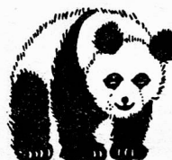
Regd. Trade Mark

... because they are made under Swiss management. You will agree when you see the wonderfully gay check, spotted, striped or tartan Hair Ribbons in all widths and colours, and the other fine-quality PANDA lines for millinery, corsetry and tailoring.