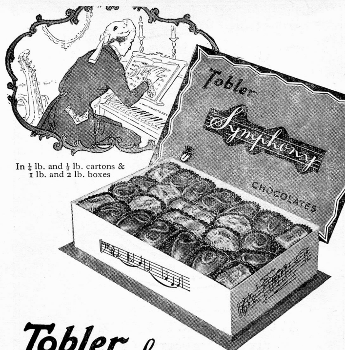
In ½ lb. and 1 lb. cartons & 1 lb. and 2 lb. boxes