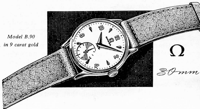
Model B.90 in 9 carat gold

OLYMPIC GAMES — For 20 years Omega has timed the Olympic Games. Again the most exacting and impartial experts have chosen Omega to time the 1956 Olympics in Melbourne, Australia. This is the highest recognition any watch has ever received from the countries of the world.