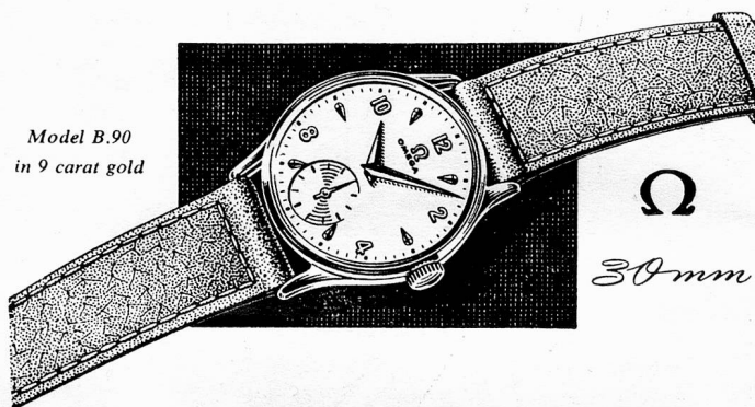
Model B.90 in 9 carat gold

OLYMPIC GAMES — For 20 years Omega has timed the Olympic Games. Again the most exacting and impartial experts have chosen Omega to time the 1956 Olympics in Melbourne, Australia. This is the highest recognition any watch has ever received from the countries of the world.