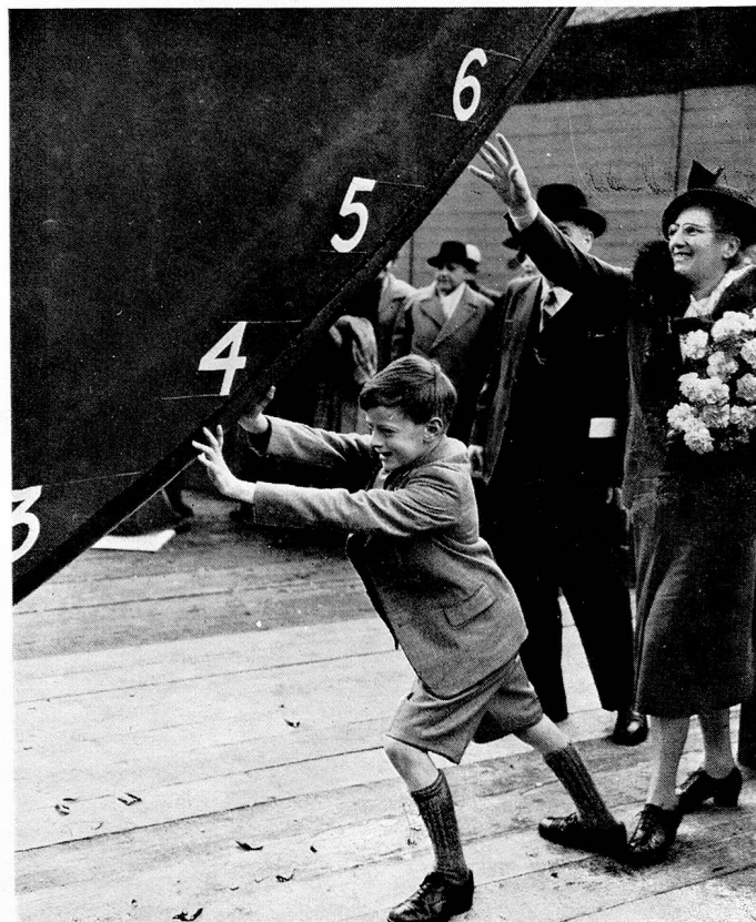
"PUSHING OUT THE BOAT."

Ship construction is a mysterious art for the sons of William Tell and when your people on top of it all begin to use nautical terms and nautical language — then we are really and truly "on the rocks". There is, however, sufficient similarity between the Scots and the Swiss for us to have all confidence in your work. Even if we do not under-