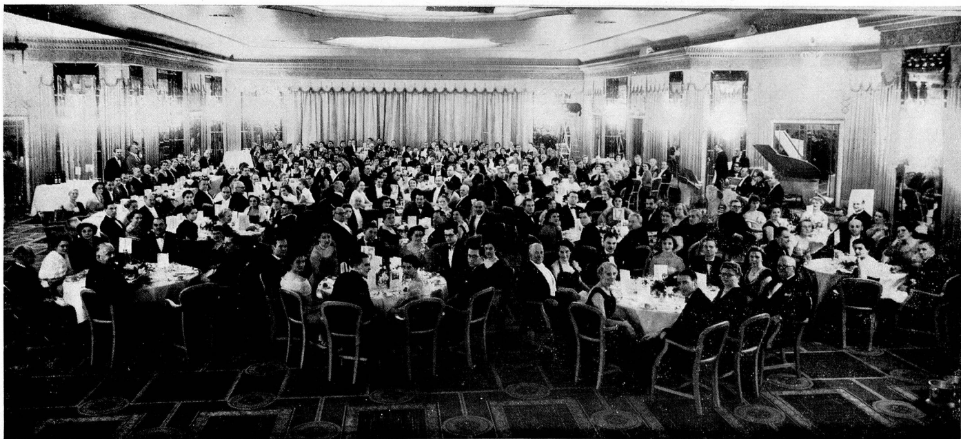
General View of the Banqueting Hall.