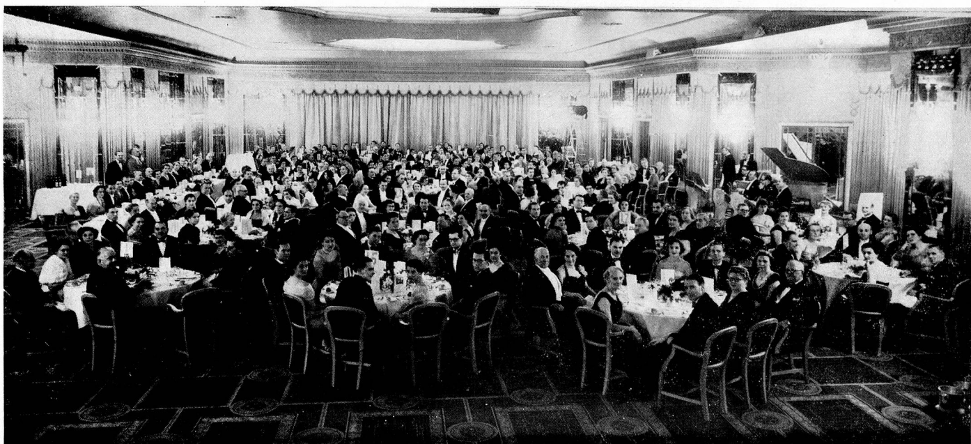
General View of the Banqueting Hall.