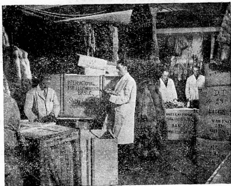
Our expert Staff pack and ship valuable Furs to all parts of the World

Official Passenger Agents for all Principal Steamship Companies - Official Freight & Passenger Agents for all Air Lines.