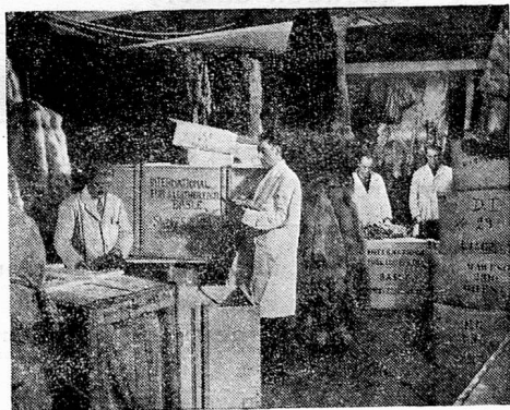
Our expert Staff pack and ship valuable Furs to all parts of the World

Official Passenger Agents for all Principal Steamship Companies - Official Freight & Passenger Agents for all Air Lines.