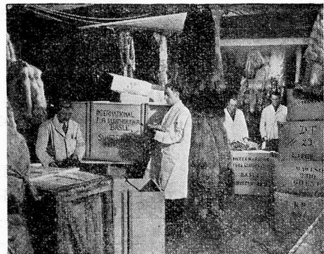
Our expert Staff pack and ship valuable Furs to all parts of the World

Official Passenger Agents for all Principal Steamship Companies - Official Freight & Passenger Agents for all Air Lines.