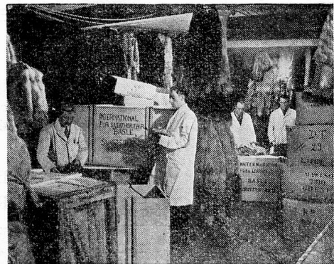
Our expert Staff pack and ship valuable Furs to all parts of the World

Official Passenger Agents for all Principal Steamship Companies - Official Freight & Passenger Agents for all Air Lines.