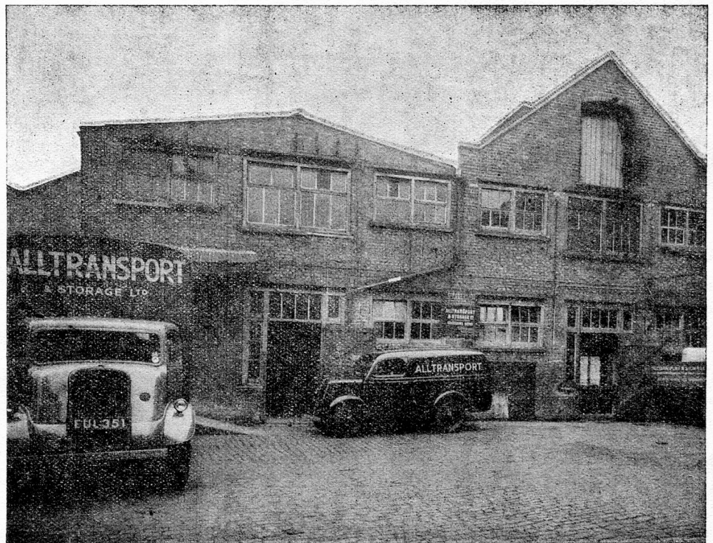
Our cartage and packing depot at Eagle Wharf Road, New North Road, N.1.