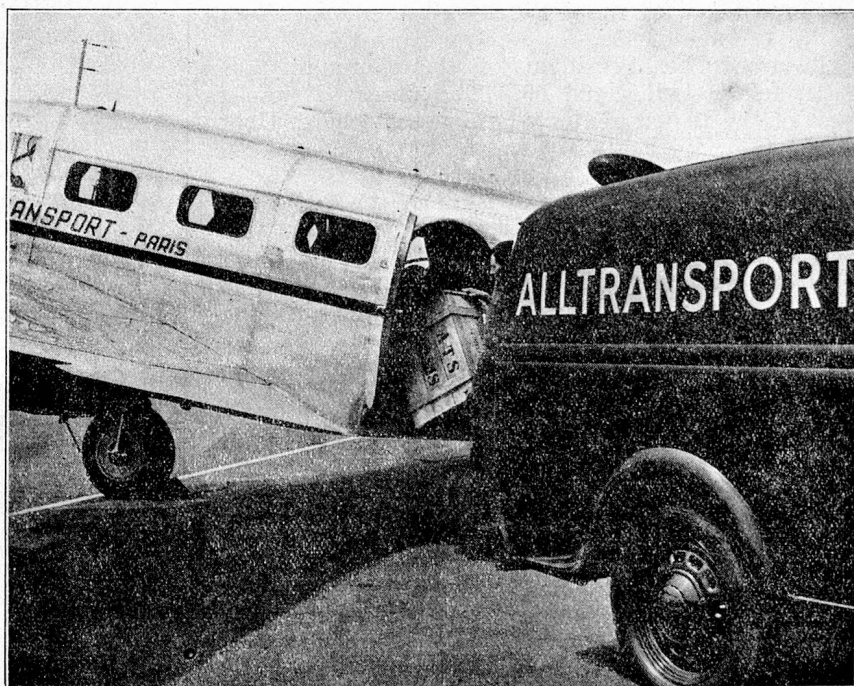
Collection from and delivery to Airports by our own vehicles.