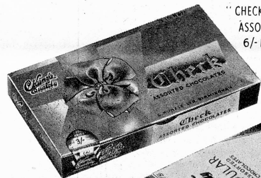
"CHECK" ASSORTMENT 6/- PER LB.