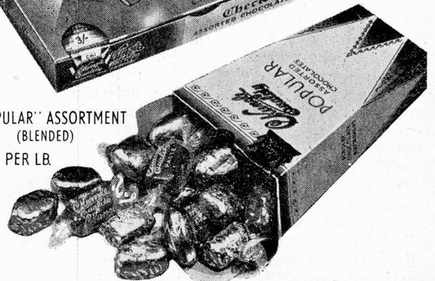
"POPULAR" ASSORTMENT (BLENDED) 4/6 PER LB.