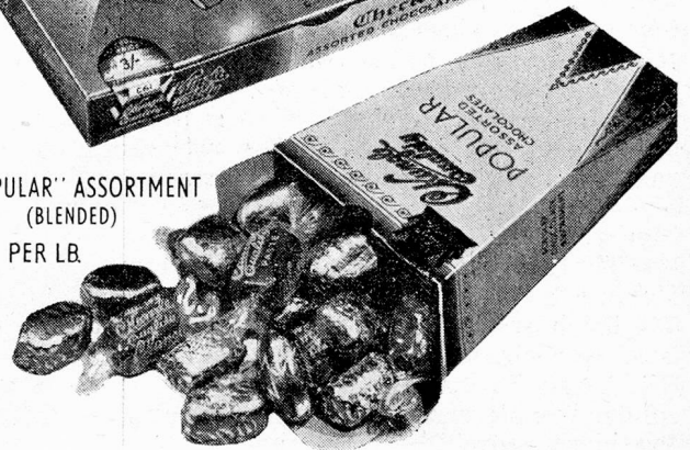
"POPULAR" ASSORTMENT (BLENDED) 4/6 PER LB.