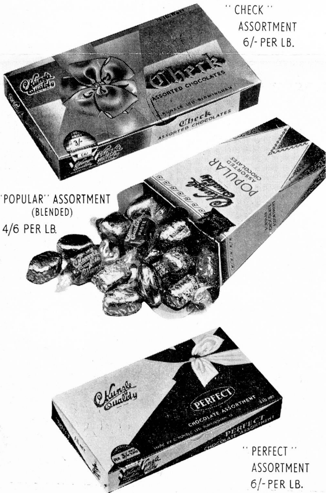
"CHECK" ASSORTMENT 6/- PER LB.