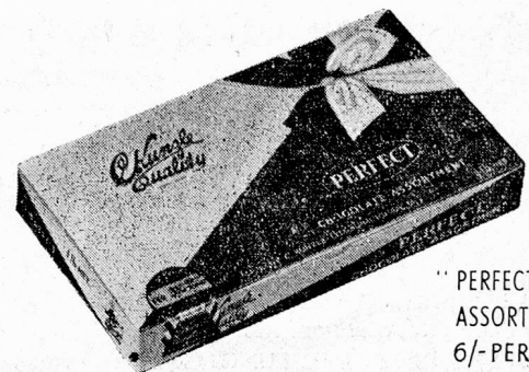
"PERFECT" ASSORTMENT 6/- PER LB.

C. KUNZLE LTD., FIVE WAYS, BIRMINGHAM, 15.