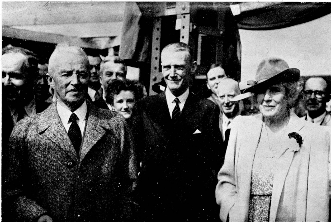
AFTER THE LAUNCHING OF THE M.V. "GENERAL GUISAN."