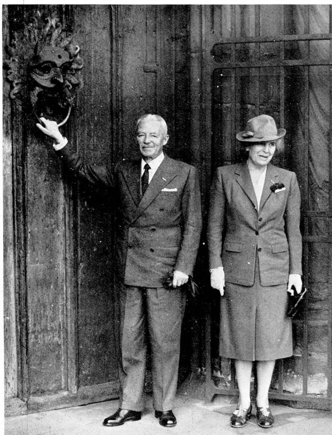
General and Madame Guisan outside Durham Cathedral.

10-ton derricks are fitted at No. 2 hatch and two 5-ton derricks at all other hatches. Three 5-ton and eight 3-ton electric winches will be supplied by Messrs. Sunderland Forge & Engineering Co., Ltd. Special cargo space with separate hatch is provided.