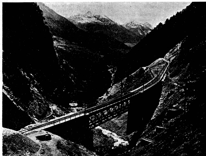
THE LOETSCHBERG RAILWAY.

We need hardly mention from which country the trouble comes, and we sincerely hope that our authorities will be firm, there must be no propaganda, from whichever country it comes, allowed within the territory of the Confederation; organisations which have a political background should be dissolved and individuals who are trying to propagate a certain "Kultur" which is in contradiction and distasteful to our national ideals, should be forthwith expelled. There must be no policy of "laissez faire" allowed.