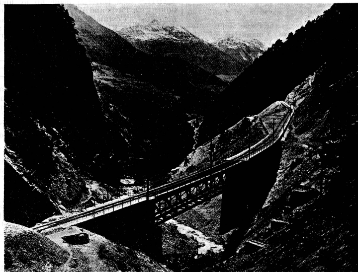
THE LOETSCHBERG RAILWAY.

We need hardly mention from which country the trouble comes, and we sincerely hope that our authorities will be firm, there must be no propaganda, from whichever country it comes, allowed within the territory of the Confederation; organisations which have a political background should be dissolved and individuals who are trying to propagate a certain "Kultur" which is in contradiction and distasteful to our national ideals, should be forthwith expelled. There must be no policy of "laissez faire" allowed.