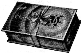
"CHARM" ½lb 2/- 1lb 4/-