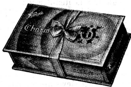
"CHARM" ½lb 2/- 1lb 4/-