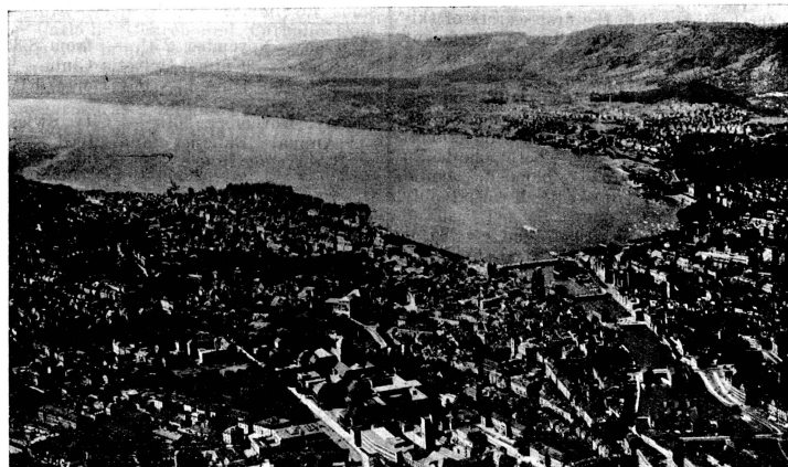
TOWN OF ZURICH WITH LAKE.

To prove that Dübendorf has become, in the real sense of the word, an international air "Port," was shown by the arrival amongst others of one of the large Imperial Airways liner "Horatius," as well as by the departure of many Mail planes to the various continental capitals.