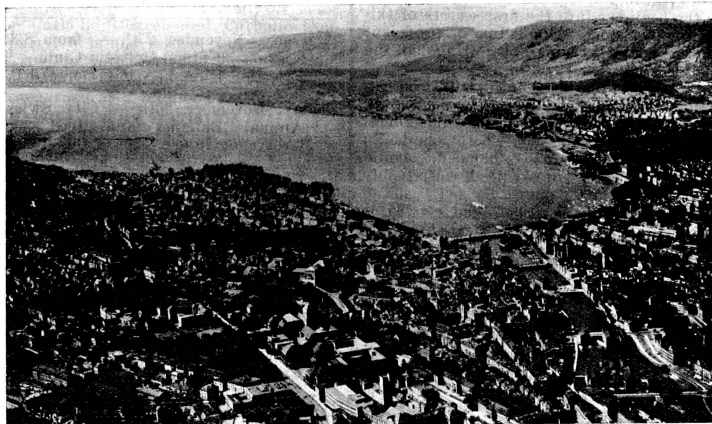
TOWN OF ZURICH WITH LAKE.

To prove that Dübendorf has become, in the real sense of the word, an international air "Port," was shown by the arrival amongst others of one of the large Imperial Airways liner "Horatius," as well as by the departure of many Mail planes to the various continental capitals.