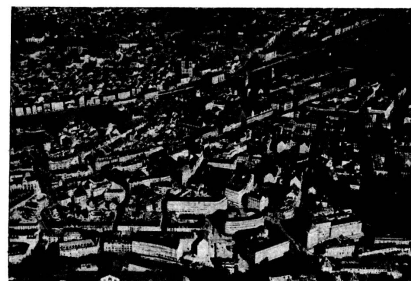
TOWN OF ZURICH.

That the canton of Appenzell is a Paradise for rock climbers was shown by a party who did some hair raising mountaineering feats, but, of course, as they do not only amuse themselves in