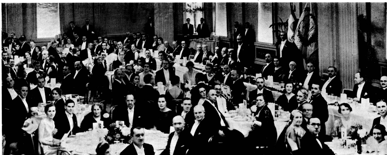
CENTRE VIEW OF THE BANQUETING HALL.

Their natural, inborn sense of unity has hitherto brought our country through many dangers and threats from within and from without. Different as may be the views and ideals amongst our citizens, they know and believe that in the end they will come together. When public order is at stake, the overwhelming majority will see to it that the disturbing elements are brought to reason. Even during these last months and weeks we have had striking examples of this, by the measures taken against the subversive and disquieting activities of proselytes of a doctrine foreign to our Swiss nature.