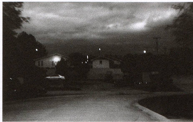
1 from «Day and Night», A book project of phone images, 2011–2013 (in progress), Tennessee

DC: Well, it also depends on what kind of “corporate”. There are a few I often address in writing. Facebook is corporate. I use it heavily. Facebook has never told me I cannot publish a piece of writing because it will turn off advertisers in the audience. The only issue – of “corporatism” – I have with Facebook is I think it should be ran from the bottom up. There is also “global corporatism”. This is linked to the way corporations have hollowed out most governments and have the ability to engage in wide social plans for us, while manipulating us through sophisticated imitations of culture and beyond. And there is a “corporate ethos”. I think of this as something like a symptom of fascism you might find in everyday relations between people or in a society's domi-