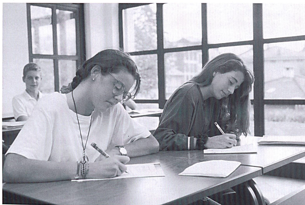
Students in a TASIS Classroom

of Vienna, Cambridge, London School of Economics and Keio University. Students are prepared for the SAT, TOEFL, Advanced Placement and International Baccalaureate exams, which are administered on campus. The School is accredited both in Europe by the European Council of International Schools and in the United States by the New England Asso-