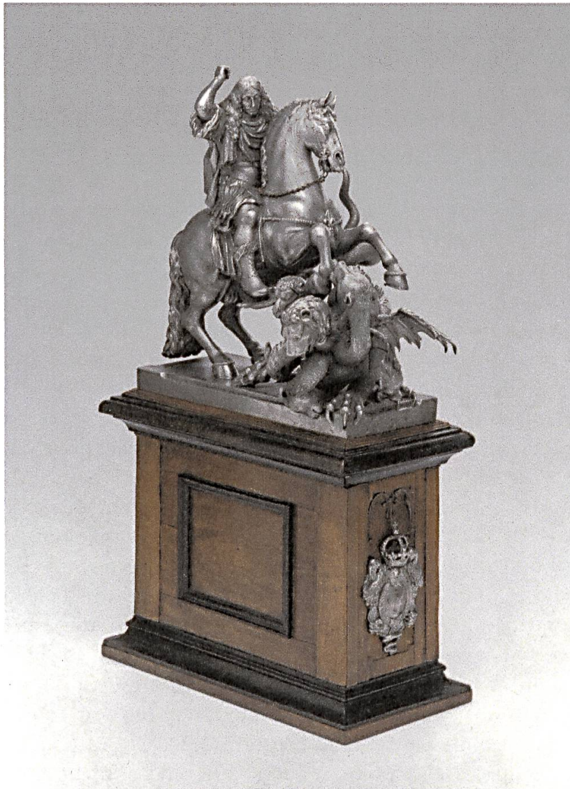
Figure 2: Gottfried Christian Leygebe, Equestrian Statuette of Charles II of England as St. George, 1660-1670, chiselled iron, 38 cm H., Grünes Gewölbe, Staatliche Kunstsammlungen, Dresden, inv. no. GG IX 2. Reproduced by kind permission.