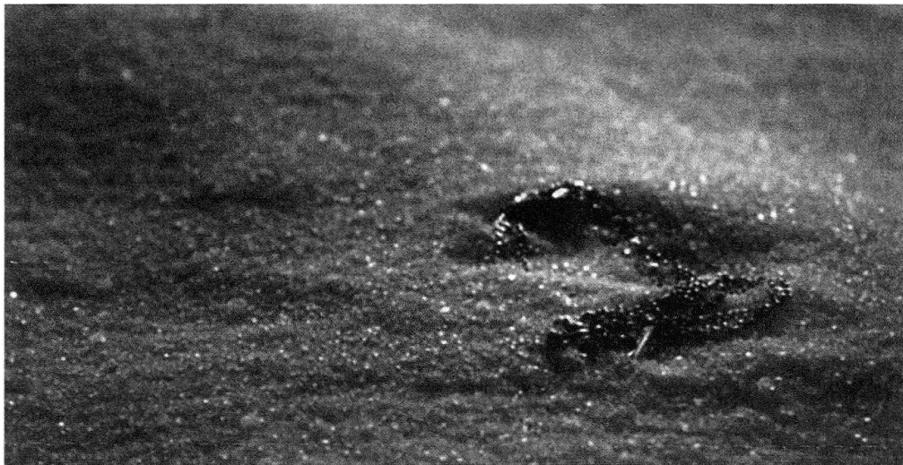
Figure 3: Quantum of Solace (digital frame enlargement)

an ironic statement. After having hunted down those who forced Vesper Lynd, his lover from Casino Royale , to commit suicide, Bond is finally able to return to duty. In the last exchange of dialogue, M says to Bond, "I need you back," and he answers, "I never left." As if to prove his professionalism, he drops the deceased Vesper's necklace into the snow. As a visual equivalent to Fleming's line "The bitch is dead," this gesture is meant to be read as Bond finally overcoming all the painful emotional attachments of the past. Traumatic loss is simply shrugged off, literally dropped. Once again, Bond escapes into action and reverts to being a successful "blunt instrument" - unhindered by any twitch of neurosis. Yet, the escape is futile, and the final image tells us so (Figure 3). In the close up of the snow with its tiny crystals of ice, we find the fractured and pixilated visuals of the new media once again, re-routed. What we see is nothing other than digital noise, commonly referred to as "snow." Bond dodges internal psychic conflict only to be engulfed by an even more conflicted war zone. His escape from personal neurosis has led him right into the neurosis of the world.