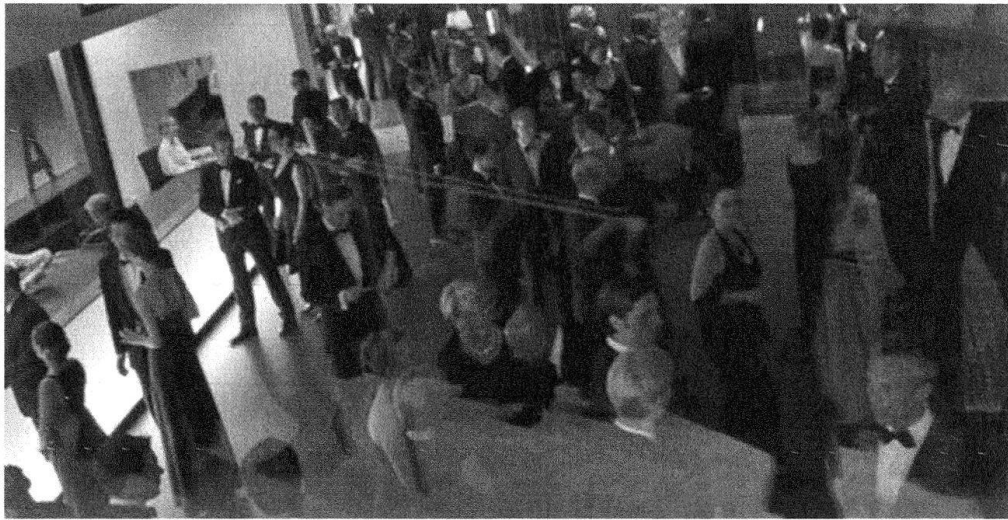
Figure 2: Quantum of Solace (digital frame enlargement)

It is indeed interesting that the last Bond movie Skyfall (2012) picks up on this visual strategy in a scene where Bond follows an assassin to the top of a glass tower in Shanghai. Like the character, the viewer's eye is trapped between glass walls reflecting Bond, the assassin and digital imagery of a billboard advertisement in the background. The scene seems all the more poignant since Skyfall is the first Bond movie shot entirely in digital format. While large parts of the movie seem eager to conceal this fact, scenes such as this one reflect – both in a literal and a metaphorical sense – the essence of the new digital medium and what it entails.