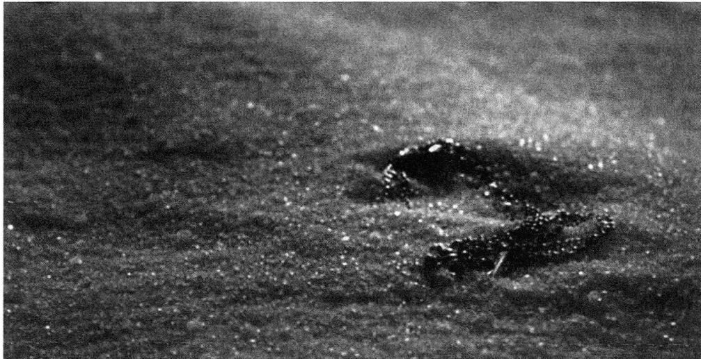
Figure 3: Quantum of Solace (digital frame enlargement)

an ironic statement. After having hunted down those who forced Vesper Lynd, his lover from Casino Royale , to commit suicide, Bond is finally able to return to duty. In the last exchange of dialogue, M says to Bond, "I need you back," and he answers, "I never left." As if to prove his professionalism, he drops the deceased Vesper's necklace into the snow. As a visual equivalent to Fleming's line "The bitch is dead," this gesture is meant to be read as Bond finally overcoming all the painful emotional attachments of the past. Traumatic loss is simply shrugged off, literally dropped. Once again, Bond escapes into action and reverts to being a successful "blunt instrument" - unhindered by any twitch of neurosis. Yet, the escape is futile, and the final image tells us so (Figure 3). In the close up of the snow with its tiny crystals of ice, we find the fractured and pixilated visuals of the new media once again, re-routed. What we see is nothing other than digital noise, commonly referred to as "snow." Bond dodges internal psychic conflict only to be engulfed by an even more conflicted war zone. His escape from personal neurosis has led him right into the neurosis of the world.