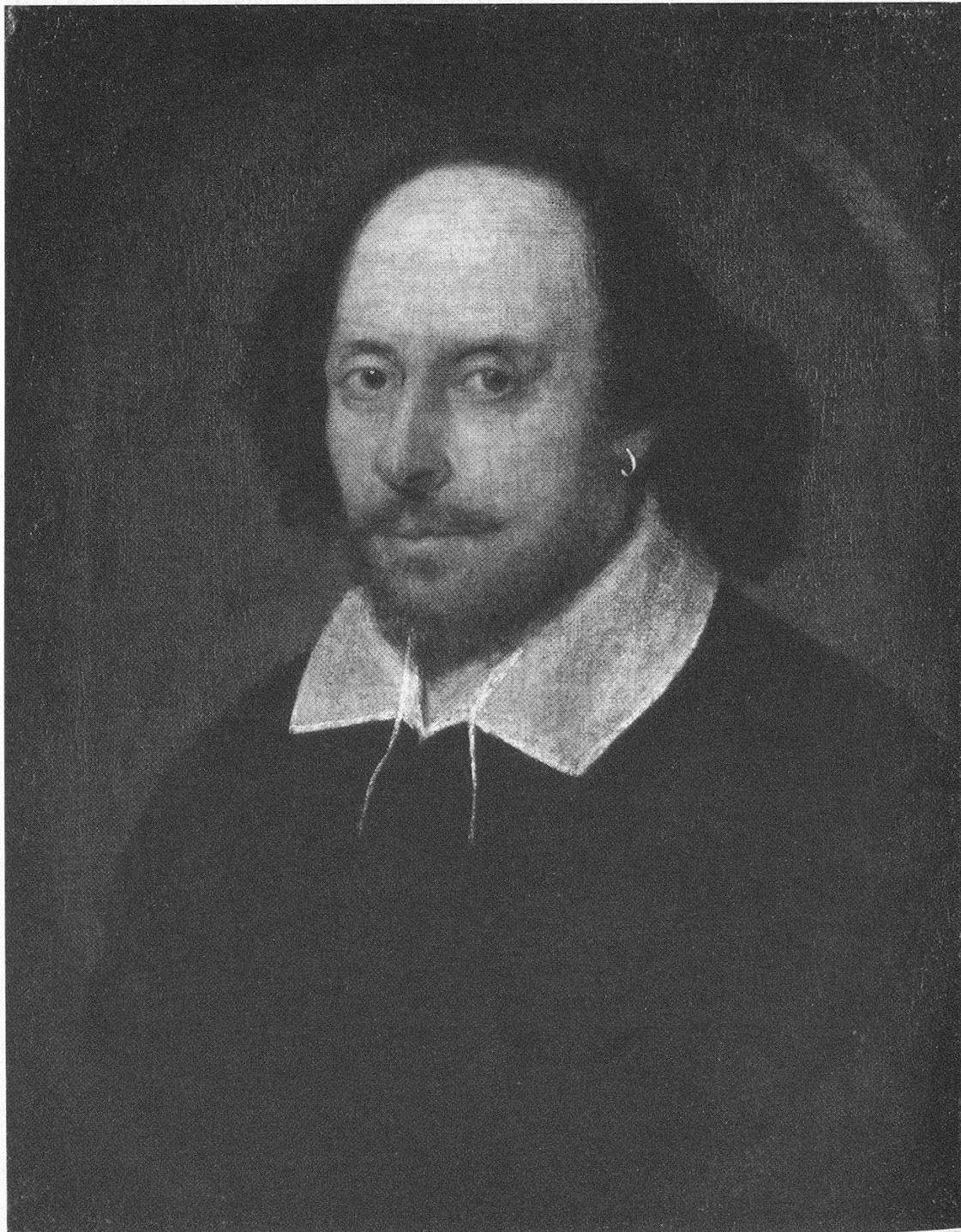
Figure 3: Attributed to John Taylor. William Shakespeare? , known as the Chandos portrait. c. 1600-10, oil on canvas, NPG 1.