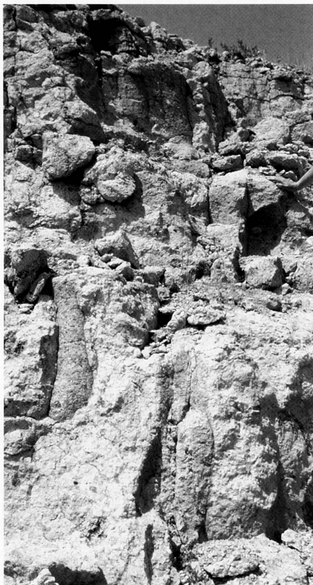
Fig. 1 Suevite wall in Aumühle quarry displaying wall-hardened trunc-shaped degassing pipes in suevite, showing both positive and negative shapes. Note the orientation perpendicular to the surface of the top of the suevite blanket. Hand in the top right for scale.

Suevite quarry of the Schwenk Zement KG, Ulm (permission and helmet required). Active suevite (impact breccia containing a significant component of melt) quarry exploited as cement additive. The suevite contains abundant vesicular melt bombs ("Flädle") and shock-metamorphosed clasts mainly derived from the crystalline basement. This quarry is presently one of the freshest