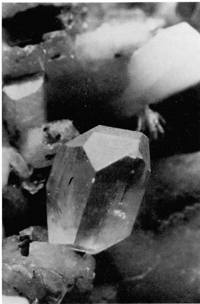
Fig. 1 Euclase crystal from Pizzo Giubine ( \times 15 ).

Since the crystals were so perfect and so few, it was a pity to damage them, so we waited until one partly damaged crystal was available for X-ray study. At the same time, during our work on Alpine gadolinite (DEMARTIN et al., in press) we had come across the problem of determining the content of lighter elements, such as boron or hydrogen, using refined crystal-structure data. By comparing the structures of gadolinite and datolite, it