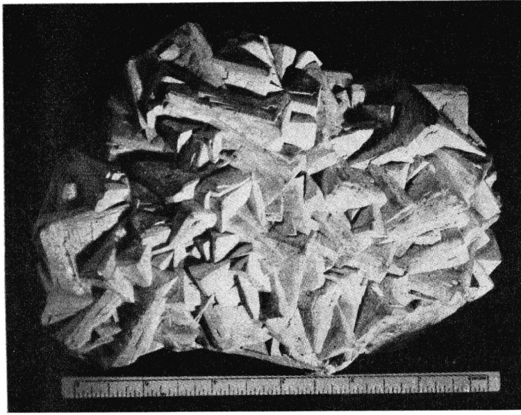
Fig. 1. Silica-fluorite pseudomorphs from Pumphrey Mt., Southern Washington.

inside the face boundaries. The tetrahexahedron faces, however, are, with a few exceptions, always smooth. Another interesting feature is the intergrowth of the different cubes. There are some regions on the specimen which suggest a certain regularity as to the angle between the neighboring cubes. In some places there are combinations of cubes which have the appearance of interpenetration twins.