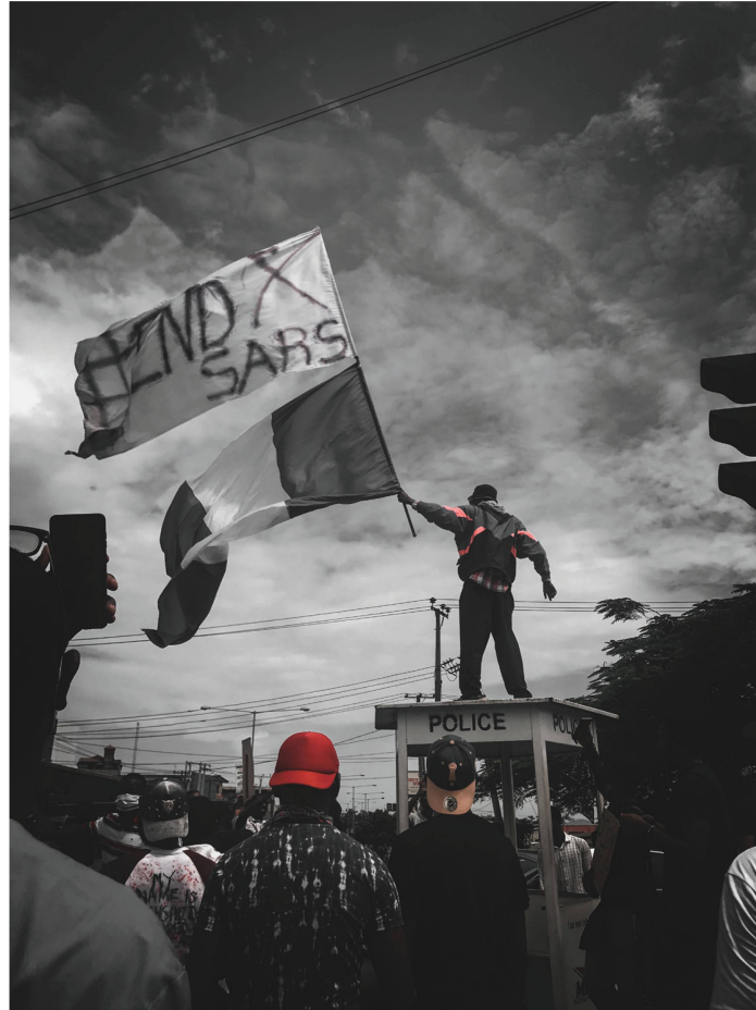
Fig. 1. "Lone Flag-bearer", 2020, Photograph by Ayodeji Adegorye.

flowing strongly in the wind. Below is a group of protesters all backing the camera but facing the Flagboy, standing high up on a commandeered police booth.