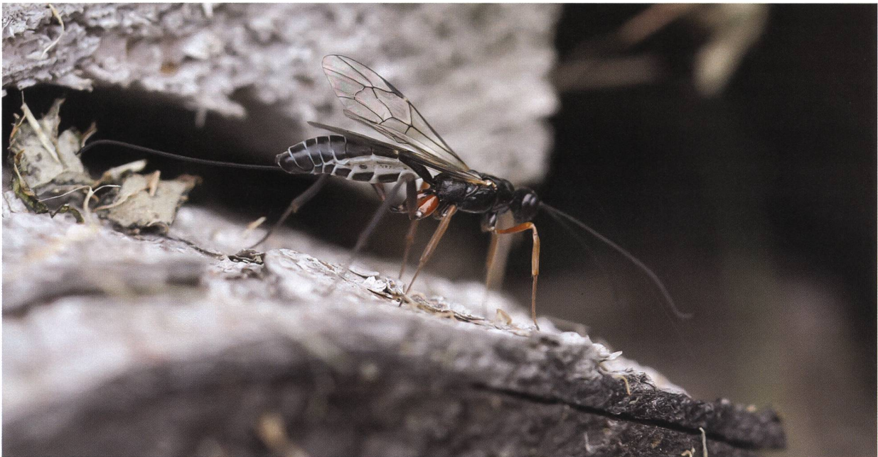
Figure 1. Xorides ater female. Freshly eclosed female resting on a Picea abies woodpile in the Swiss Canton of Bern.