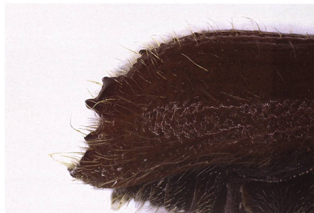
Figure 1. Lateral view of a male Ips duplicatus showing the characteristic spines 2 and 3 on its declivity.

The catches were morphologically and genetically identified to the species level. Morphological identification was done using the key of Pfeffer (1995). Comprehensive and well-illustrated compilations of the key characteristics for discriminating the closely related Ips species, i.e. I. typographus , I. amitinus , and I. duplicatus , can be found in Steyrer (2019) and Bussler (2020). The most typical feature is the ridge between spines 2 and 3 (Fig. 1). The sexes