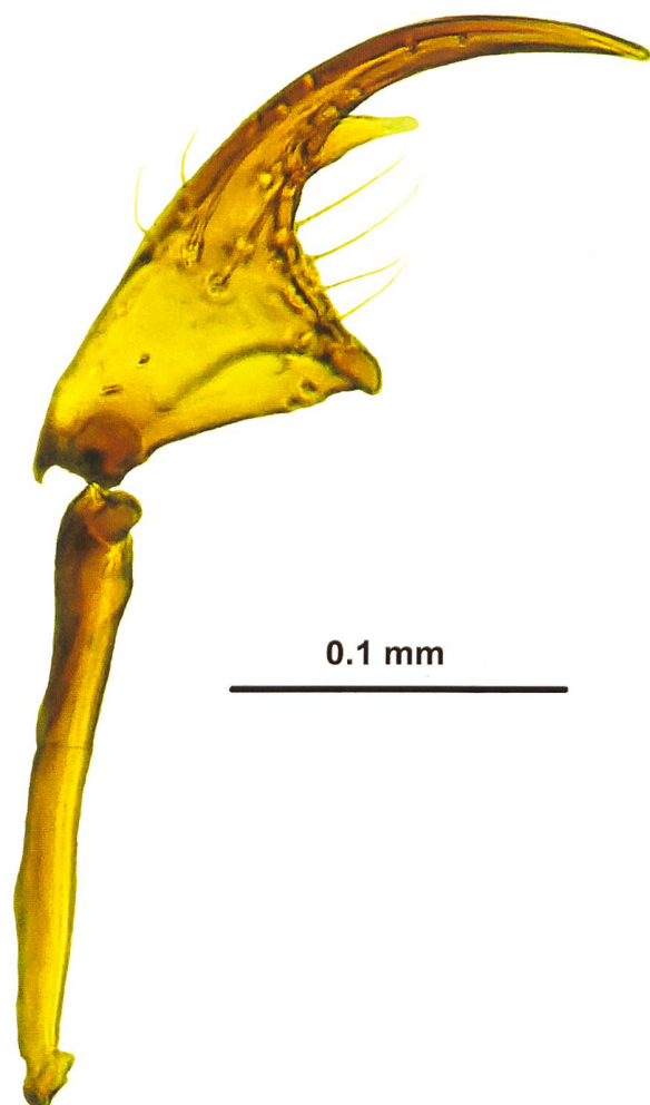
Figure 5. Trilophidius gemmatus sp. n., female coxostyli, paratype, dorsolateral view.

larly arranged band of punctures, interrupted at middle. Eyes large, convex; ommatidia distinct, convex; genae and tempora small. Labrum slightly excised, with indistinct reticulation, five-setose. Mandibles distinctly acute at apex, each with three molares basally.