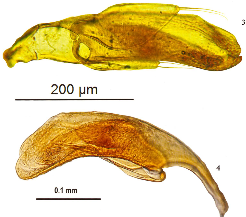
Figures 3–4. Trilophidius gemmatus sp. n., holotype, male genitalia. 3 Overview of the aedeagus with median lobe and parameres, dorsolateral view. 4 Median lobe showing the internal structures of the aedeagus, ventral view.