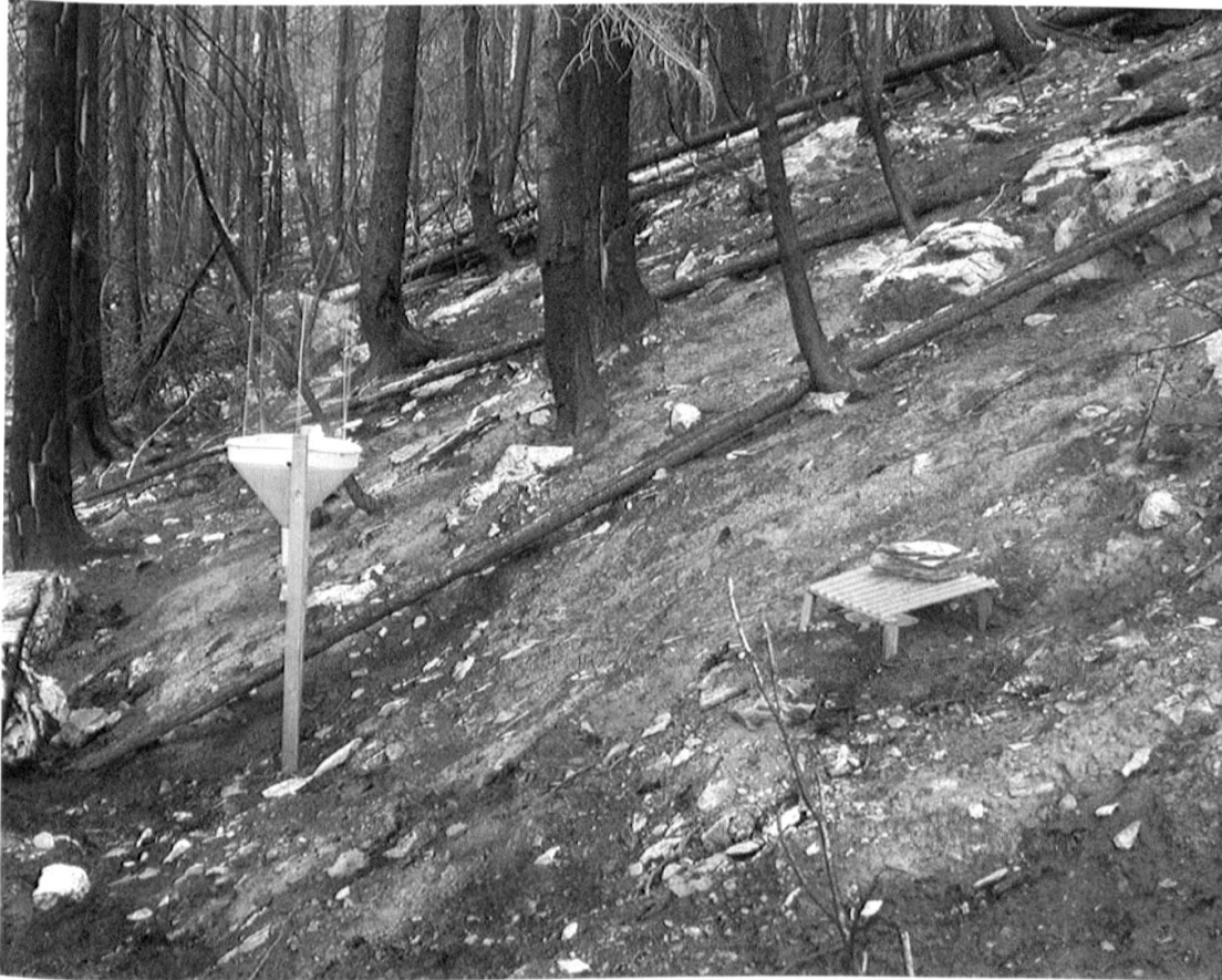
Fig. 2. Window trap and pitfall trap of a trap site in the burnt area.

The climate is continental with cold winters and dry summers (Zumbrunnen et al. 2009). Mean annual temperature decreases from 8.6 °C at 640 m a.s.l. to 5.2 °C at 1500 m a.s.l., while annual precipitation ranges from 600 mm at 640 m a.s.l. to 1000 mm at 1500 m a.s.l. (1961–1990) (Aschwanden et al. 1996). The 60-year old forest extended from a xerothermic mixed forest of oak ( Quercus pubescens ) and Scots pine ( Pinus sylvestris ) at 800 m a.s.l., to spruce ( Picea abies ) and open larch ( Larix decidua ) forest at timberline at approx. 2000 m a.s.l. (Moretti et al. 2010). Within each vegetation type the forest was homogenously structured, with the exception of small gaps of former pastures and rock outcrops. Along the altitudinal gradient, forest density and canopy coverage decreased with altitude.