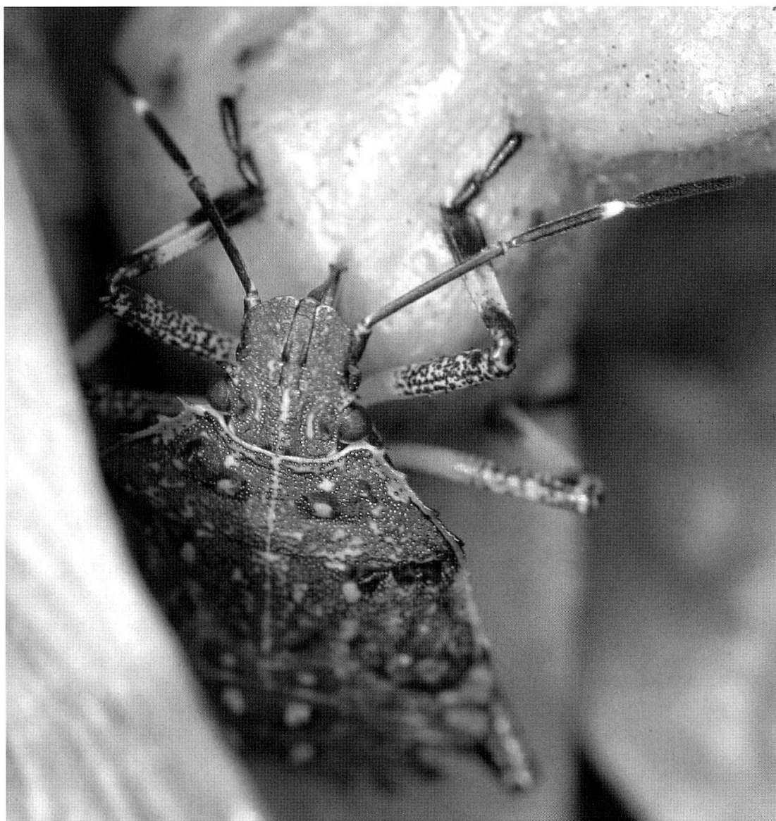
Fig. 3: Late instar nymph of Halyomorpha halys sucking on a seed of Acer pseudoplatanus .

The brown marmorated stink bug is an extremely polyphagous insect. Primary hosts are woody plants, including fruit trees and ornamentals. In the US study (Bernon 2004) and in the literature from the East Asian countries of origin (Hoebeke & Carter 2003; Funayama 2004; Kiritani 2007), up to 100 plant species are listed. The most important hosts include fruit trees and bushes such as apricot ( Prunus armeniaca ), cherry ( Prunus avium ), peach ( Prunus persica ), plum ( Prunus domestica ), apple ( Malus spp.), pear ( Pyrus spp.), Citrus spp., mulberry ( Morus spp.), persimmon ( Diospyros spp.), raspberry ( Rubus spp.), and grape ( Vitis vinifera ); leguminous field crops such as soybean ( Glycine max ), common bean ( Phaseolus vulga-