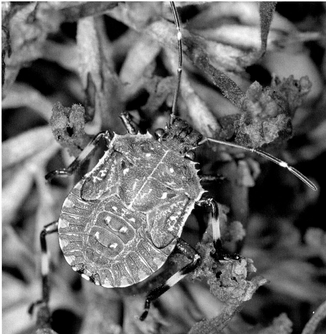
Fig. 2: 4th instar nymph of Halyomorpha halys with spines on the pronotum and white bands on the tibiae.

The literature on this invasive species available in English is quite scarce because the insect has only recently been found outside East Asia. Most information presented here relies on the literature review by Hoebeke & Carter (2003) and on data from the first studies done in Allentown, PA in the USA after the positive