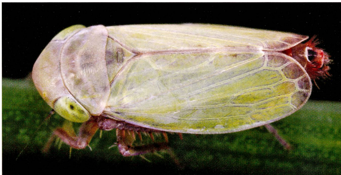
Fig. 3. Laburrus pellax (Horváth, 1903).

cultivated in gardens. A. linosyris does not occur within the city of Zurich or in adjacent areas (Info Flora 2016) and was absent from all of the 85 gardens investigated (D. Frey, unpublished results). However, Aster spp. are very common garden plants, and were found in many of the 85 gardens in this study. This suggests that L. pellax may also feed on other species belonging to the genus Aster . For instance, in the botanical survey of the 85 study gardens, A. dumosus , A. novae-angliae , A. novi-belgii were frequently cultivated (D. Frey, unpublished results). Furthermore, the urban heat island effect (Pickett et al. 2011) may favor L. pellax , which naturally occurs in xerothermic habitats.