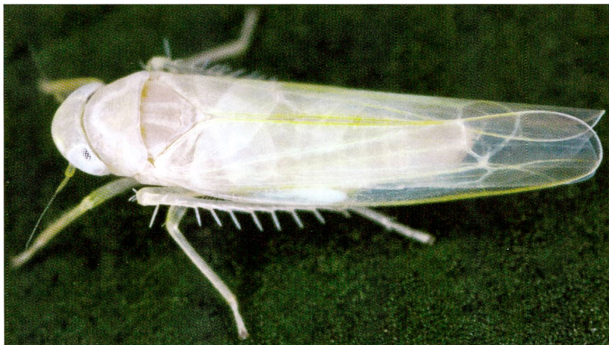
Fig. 1. Edwardsiana sociabilis (Ossiannilsson, 1936).

In the following section, for each individual of the new species recorded, we inform about the garden type, geographical coordinates, altitude, date of collection, number of individuals, sex, trap type and, for pitfall traps, the habitat type.