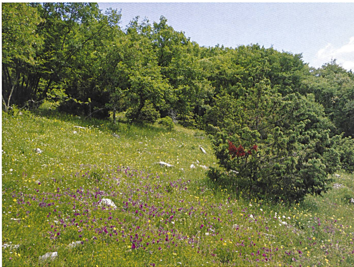
Fig. 3. Locus typicus of Brachysomus xanthianus sp. n. on Mount Xanthi.

habitat consisted of a low Quercus ilex and Juniperus forest and a rich herbaceous cover growing on xerothermic limestone outcrops near the top of Mount Xanthi at altitudes between 660 and 820 m a.s.l.